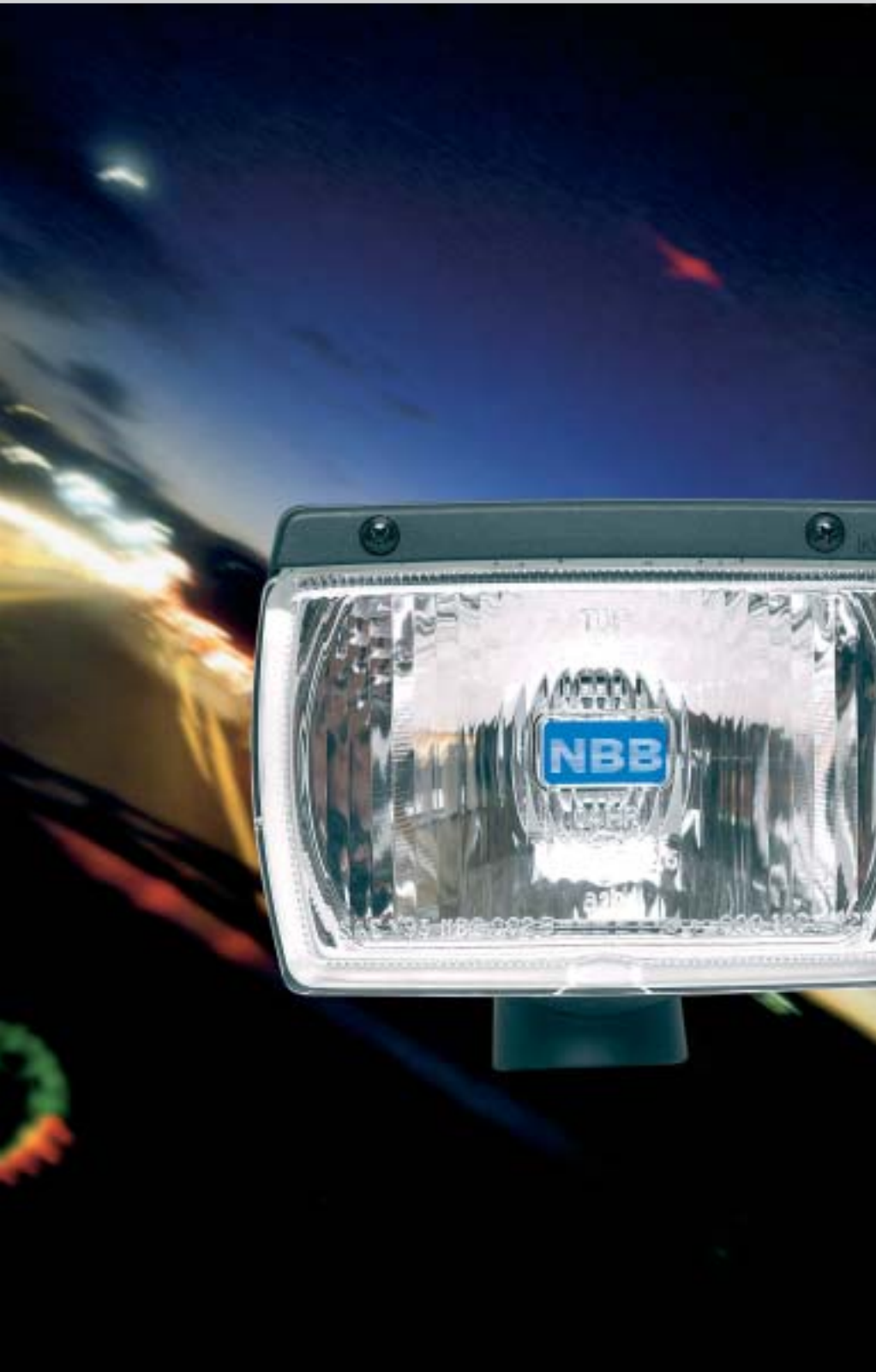
AUXILIARY LAMP BETA